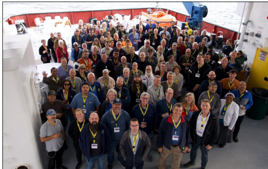
Participants on the Sandy Hook Pilot Boat in New York Harbour "First things First"