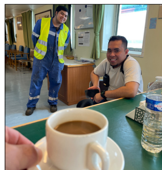
Atlantic Starbucks on the Atlantic STAR!