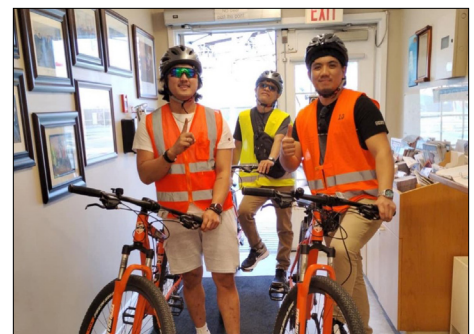
NYK Romulus crew heading for a bike ride to Point Pleasant Park