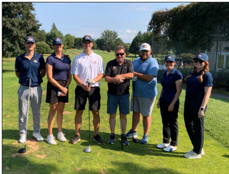
Horizon Maritimes tied best scoring team with Maritime World Logistics