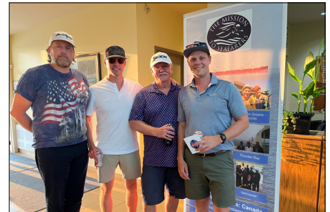
MWL tied best scoring team, men's longest drive and also won closest to the pin