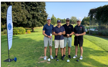
Bluewater Group/Edge Marine