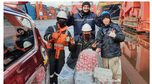
Crew of ALS APOLLO receive shoebox gifts

Covid-19 has created huge challenges for people around the globe, but seafarers have the added burden of border restrictions and the impact on repatriation and crew changes, not to mention the stress of distance from family and friends, issues which vastly affect mental health.