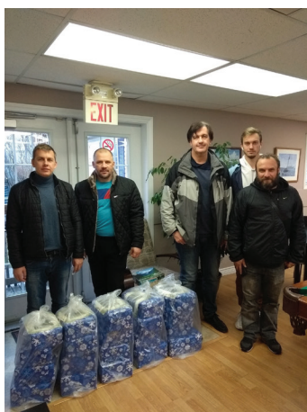
Maersk Palermo crew visit Mission